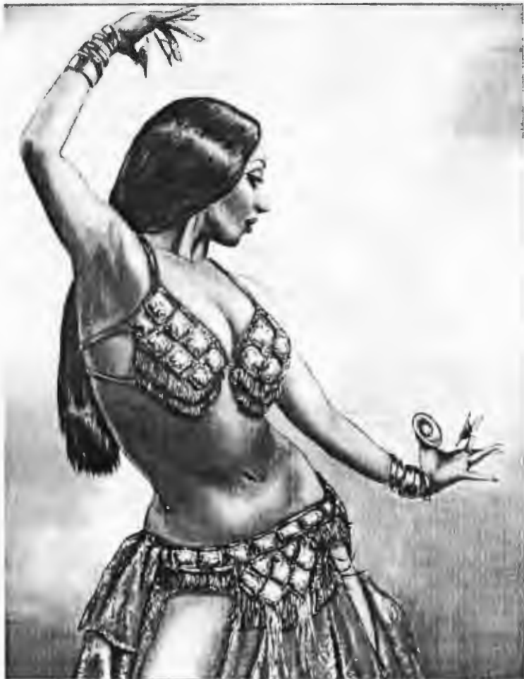
ORIGINAL ART BY LILY SPLANE